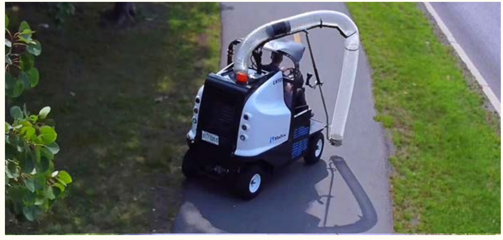
Technical specs are subject to change without prior notice